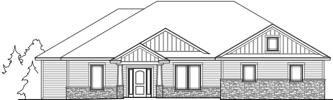
Front (East) Elevation